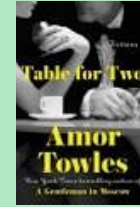
Table for Two by Amor Towles